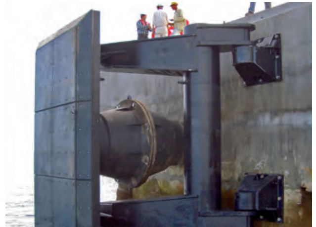
Oil Terminal | Labuan | Malaysia