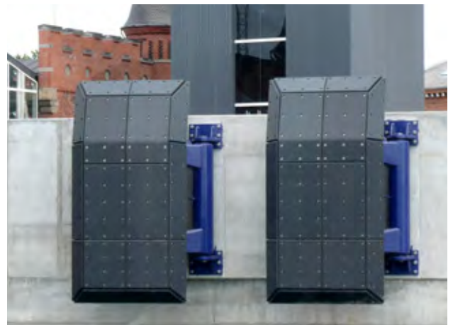
Ferry & RoRo Terminal | Gedser | Denmark