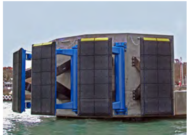
Ferry Terminal | Gotland Island | Sweden