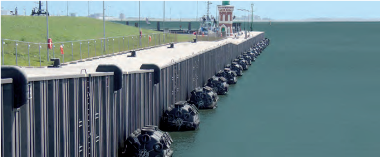
Kaiserschleuse | Bremerhaven | Germany